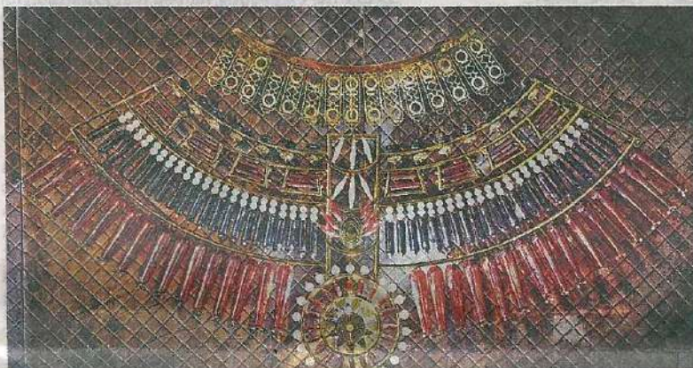
A new line of totemic necklaces (example, above) and lighting fixture (top) created by lighting designer duo Gautam Seth and Prateek Jain (left)